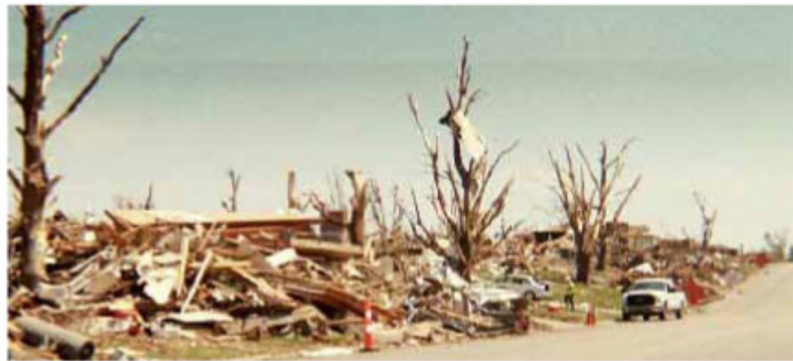
Aftermath of Joplin tornado.

Orphan Grain Train continues to work to meet the needs of the tornado victims, not only in Joplin, but also in Birmingham. As in past disasters, Orphan Grain Train will be there for the long haul, no matter how long that may be.