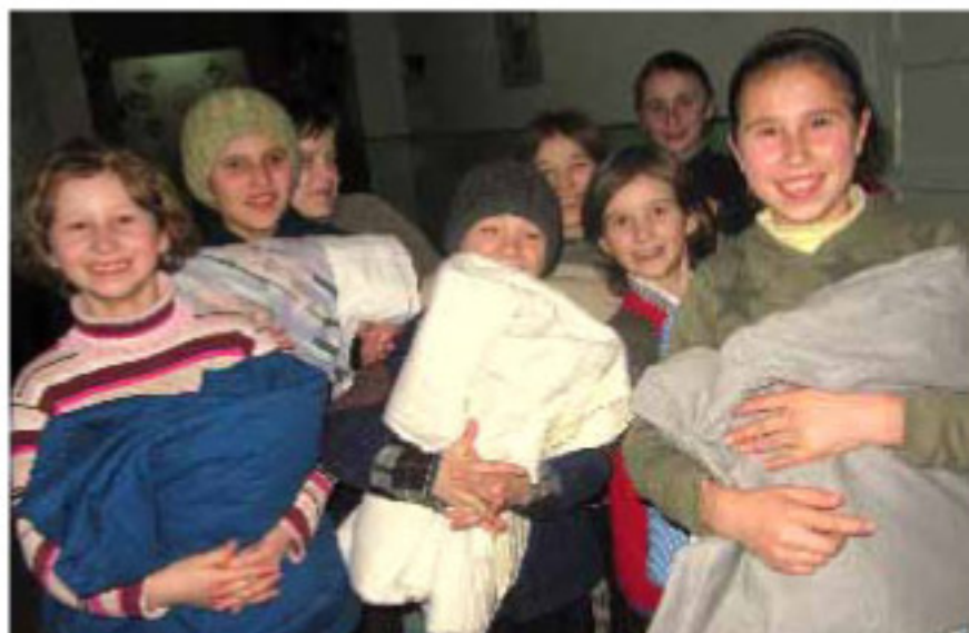
Orphans happy to have quilts.