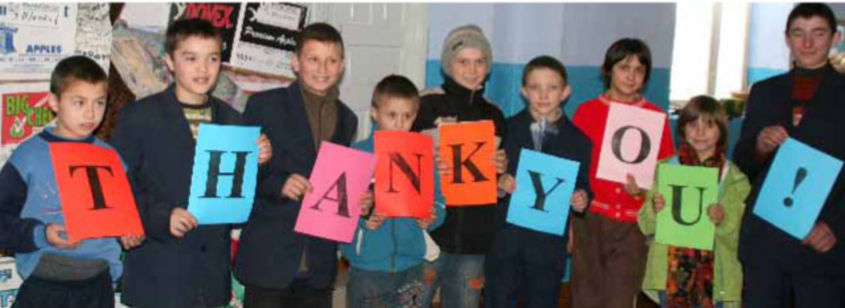
Orphans say "Thank You"

Imagine yourself in the winter of 2009, in a small village in a former Soviet Republic, where people live in unthinkable circumstances. Many of the small, dilapidated homes have only a tiny wood burning stove, and limited, if any insulation. The bone chilling winter seems to last forever. Without adequate heat or warm clothing, only the sturdy ones last through the long brutal winter. Furnishings are meager, jobs are non-existent, and luxuries like a change of clothing, a pair of shoes with the sole intact, or a cup of warm tea are just a dream. The handicapped or disabled are