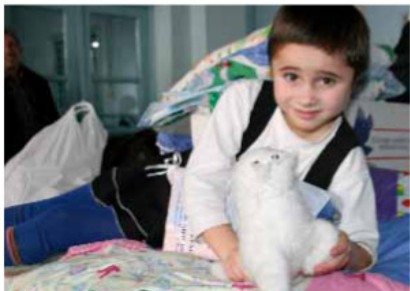
Orphan girl with comfortable quilts.