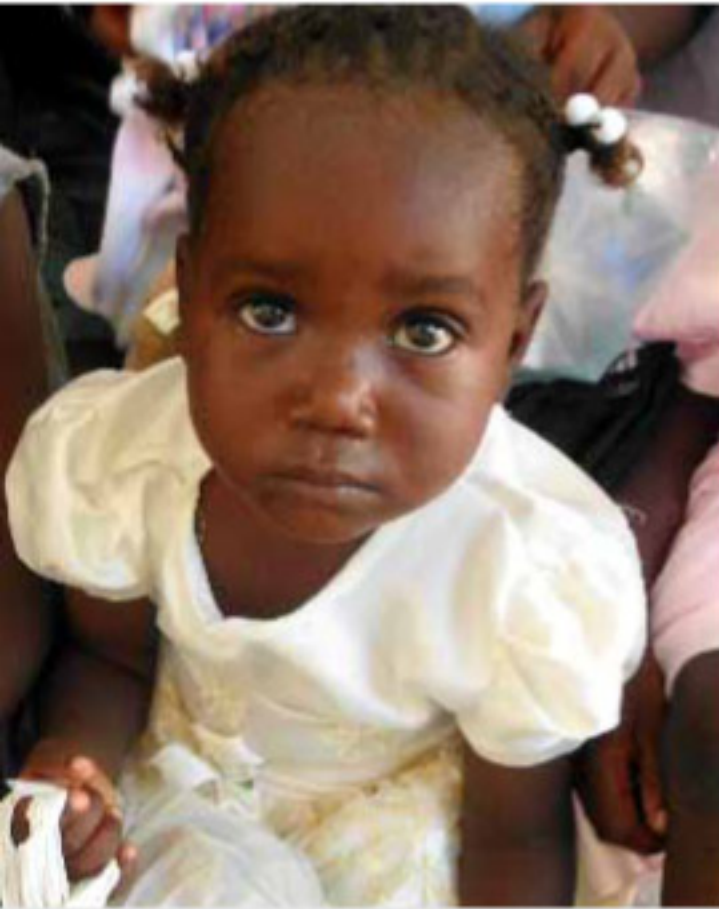
Toddler now has clothing and food.

Two 40 ft. shipping containers of relief supplies, bound for the Dominican Republic were loaded in January at Orphan Grain Train branches in St. Louis, and Wisconsin. They arrived at Iglesia Evangelica Luterna in February, and contained everything from hospital linens and medical equipment, to school desks and supplies. The following is a portion of a thank you from a missionary in the Dominican Republic: