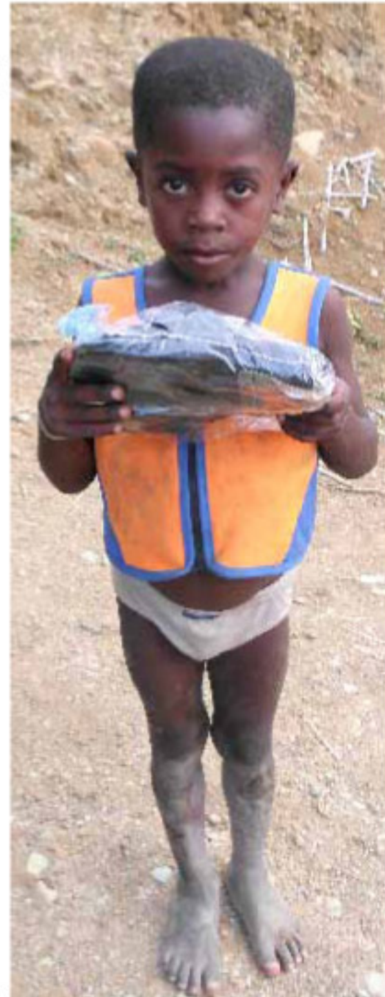
Thank you for new shoes.

We thank you again for all that you and your church and team of volunteers did to serve our mission in the D.R. May the Lord continue to bless your efforts of evangelism and service in your community and around the world. Blessings.