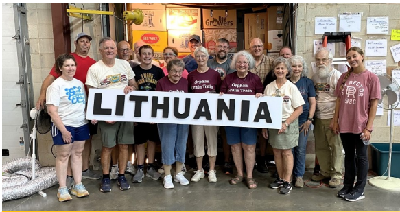
Loading team poses with a new sign!