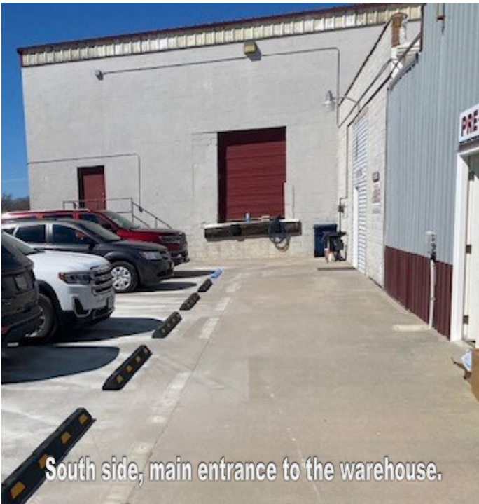
South side, main entrance to the warehouse.

We have new upgrades to our parking area around the warehouse. Concrete was poured to expand our parking area about three weeks ago by Hartford Brothers Construction. Parking stops were installed by volunteer, Dwight Rash, on April 4,