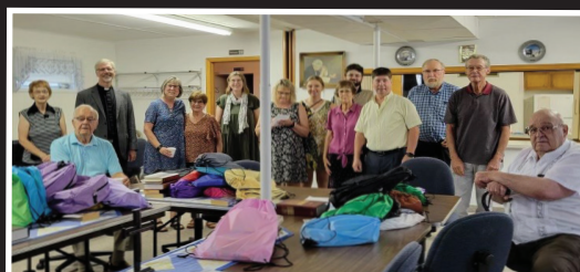
Trinity church in Tolley ND school kits