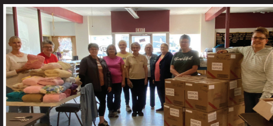
United Women in Faith packed 37 hygiene kits and several boxes of scrubs