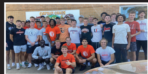
UJ basketball team packed 11,880 meals