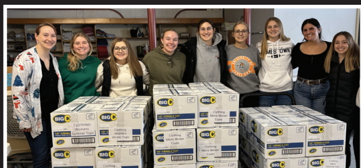
Alpha Chi group from the University of Jamestown and the clothes they donated and packed.