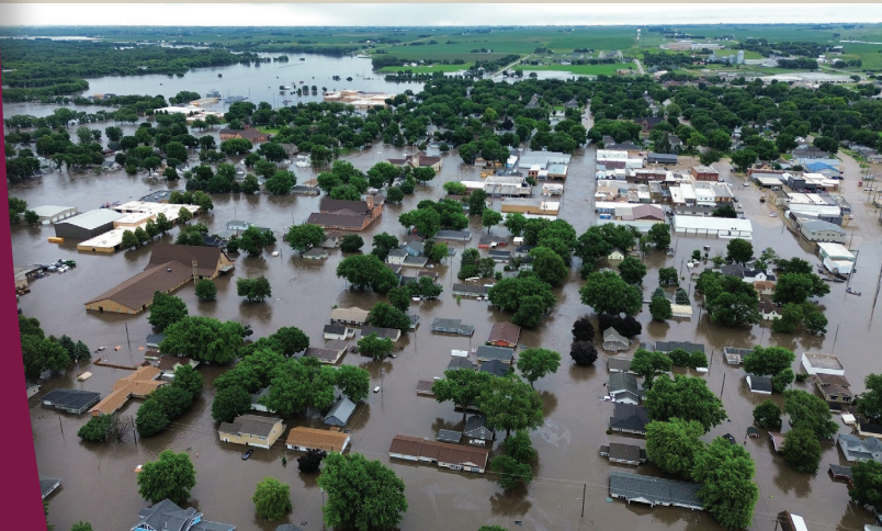
Rock Valley, IA is one of many towns devastated by catastrophic flood waters. The overwhelming clean-up and destruction are massive in NW Iowa.

Orphan Grain Train is blessed to have supporters with big hearts to give monetary and relief supplies