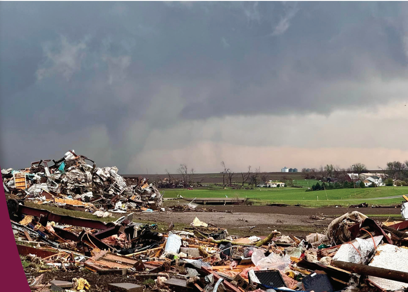
The destruction left behind by an EF3 tornado devastated many families in Nebraska. Orphan Grain Train is helping with tornado & flood relief efforts in the Midwest. Read more on pages 1-3.