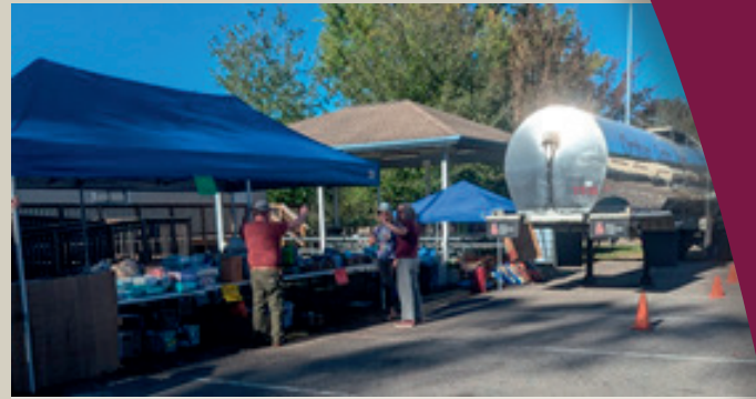
OGT's 5,300-gallon tanker is set up for use with showers and flushing toilets at Emmanuel Lutheran Church in Asheville, N.C. Volunteers & local families were grateful for the use of the tanker and also for food and supplies that were delivered earlier. Praise be to God.

This will be a long-term clean up and restoration process and we plan to help families get through this devastating disaster. If you can find it in your heart to give, you can give securely on our website at www.ogt.org or use the enclosed envelope to mail a check earmarked for hurricane relief. Thank you for your support with giving comfort to many families that have lost so much. God's blessings to you and your family.