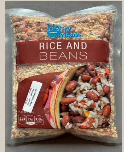
The new mixture of Mercy Meals contains the same needed nutritional value but with the addition of red beans.

Would you and some friends, co-workers or church group like to help feed the hungry? We are looking for groups interested in making Mercy Meals to help increase the number of lives nourished & fed. For more information, please contact Nettie at OGT's Norfolk warehouse at 402-371-7393 X108 or email at agrizzard@ogt.org.