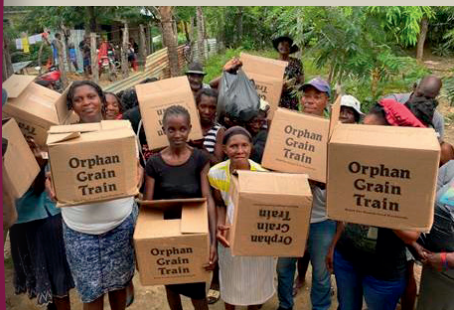
1,188 boxes of Mercy Meals were distributed in Haiti! It has been 3.5 years since we have been able to get a shipment into the country. Praise be to God!