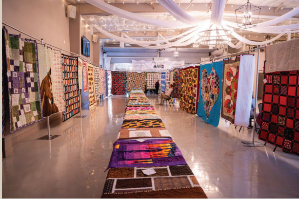
The display of 56 donated handmade quilts that were auctioned off to raise funds for Iowa families recovering from massive flood waters.

Orphan Grain Train is expanding Adopt-An-Orphanage into Ukraine and welcomed speaker Alla Vasylieva