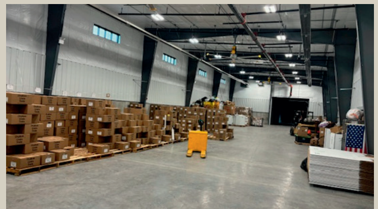
Photos are of the new warehouse section being used during the dedication and today with pallets of aid. Soon racks will be put up on both long walls and in the center to be filled with pallets of aid ready to be shipped worldwide.